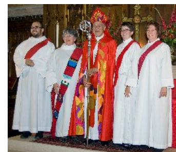
Four seminarians were ordained to the transitional diaconate on Thursday, July 23, at St. Mark's Cathedral in Minneapolis. All four will begin their final year of seminary this fall.

The diocesan bishop heads the geographic diocese of Minnesota, which encompasses the entire state and includes 106 congregations with approximately 22,000 baptized members. The diocesan bishop serves as the chief pastor to the 303 clergy in the diocese. The Diocese of Minnesota is one of 110 domestic and overseas dioceses in The Episcopal Church, which is one of the 38 provinces of the Anglican Communion.