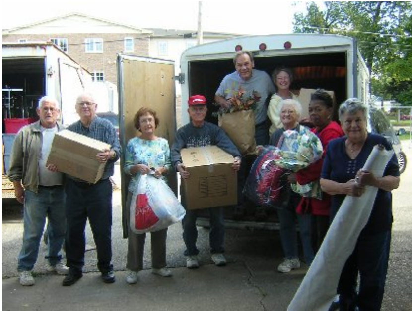
Picture of our flood donations being delivered to Cedar Rapids by the Congregationalists.